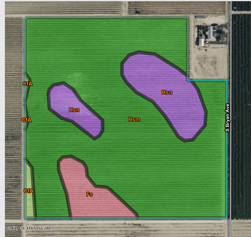
California Revised Storie Index (CA)