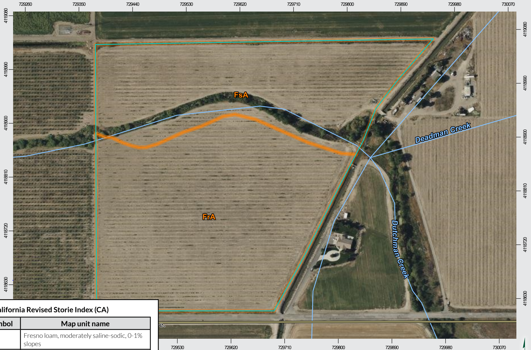
California Revised Storie Index (CA)