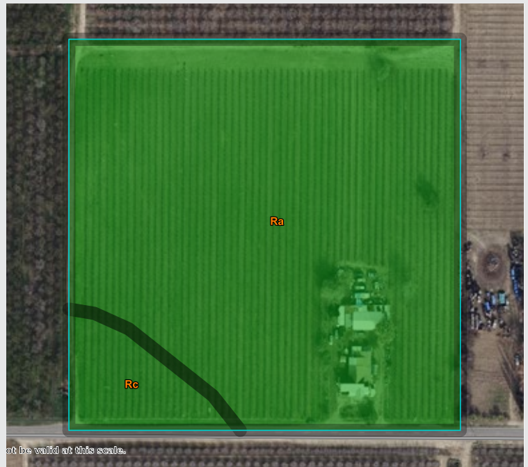
not to be valid at this scale.

SOILS MAP LEGEND Ra = Ramona sandy loam Grade 1 - Excellent Rc = Ramona loam Grade 1 - Excellent