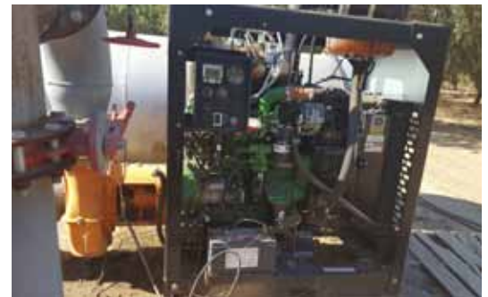
John Deere Booster Pump