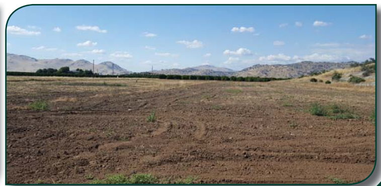
Open Land Ready to Plant