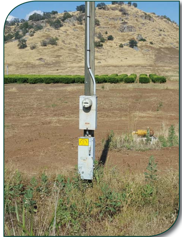
Open Land and Well