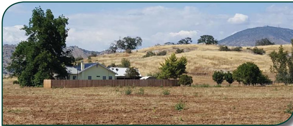
Home and Hill for Possible Home Site